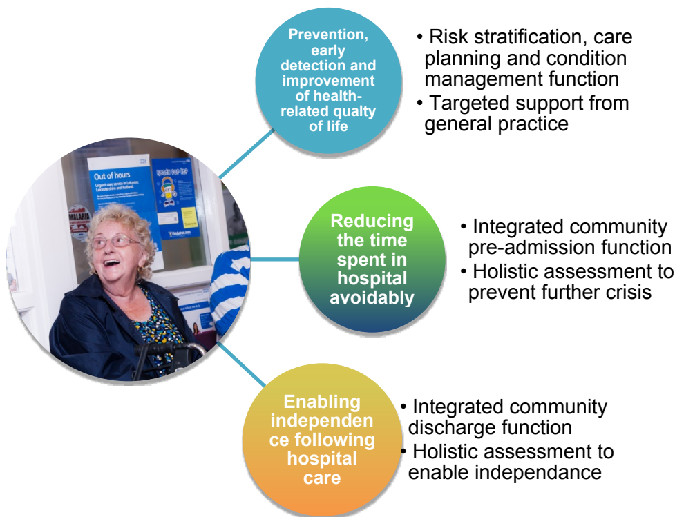
The Leicester City pre- and post-hospital pathway

For this population, we propose to continue to invest in specific services in the following areas: